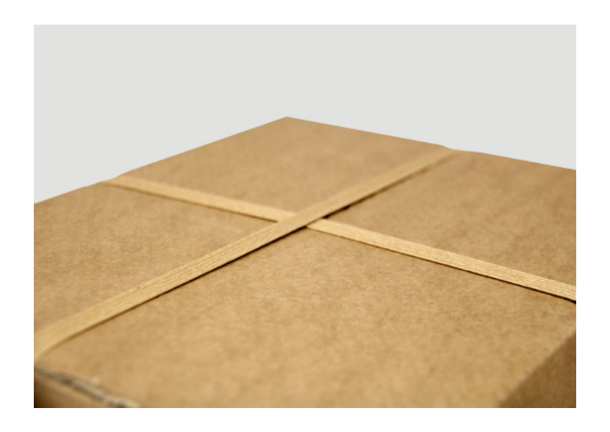
< Click here for a video of paper strap >

Our paper strap consists of paper fibers that are twisted together like a cord. These paper cords are then glued together with an environmentally friendly glue. This creates a stable strap that is very resilient.