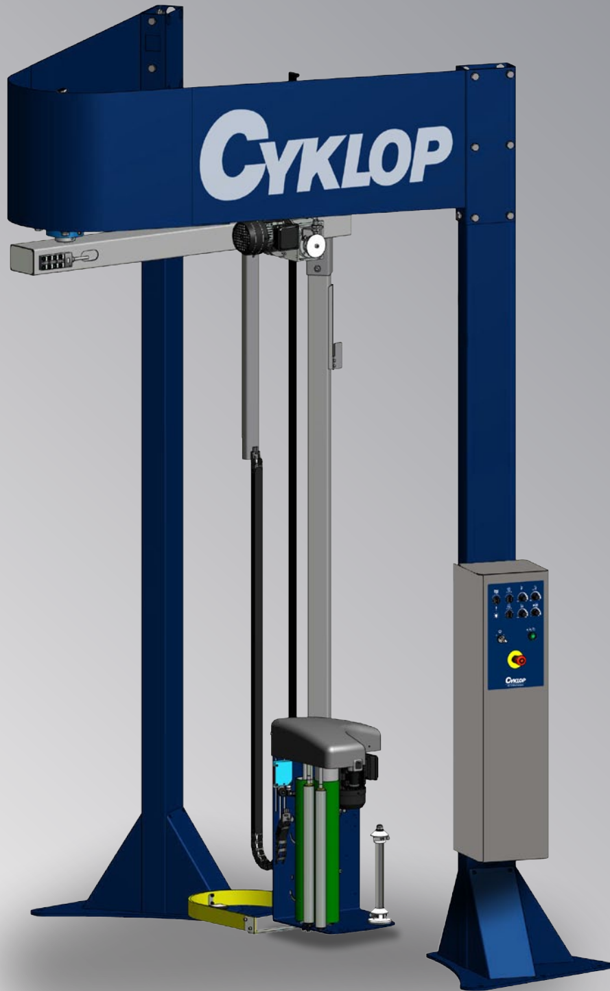
Stretch Wrapper CTA 215